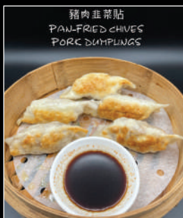
豬肉韭菜貼 PAN-FRIED CHIVES PORC DUMPLINGS