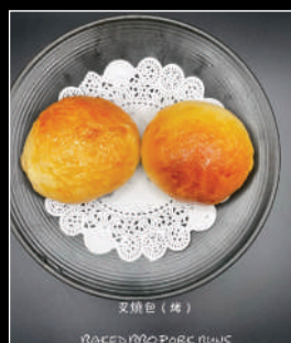
叉燒包 (炸) PACED PORK BUNS