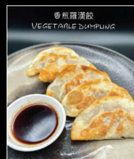
香煎羅漢餃 VEGETABLE DUMPLING