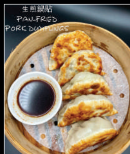
生煎鍋貼 PAN-FRIED PORC DUMPLINGS