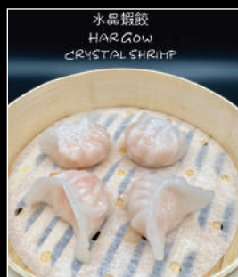
水晶蝦餃 HAR GOW CRYSTAL SHRIMP