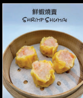
鮮蝦燒賣 SHRIMP SHUMAI