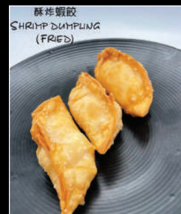
酥炸蝦餃 SHRIMP DUMPLING (FRIED)