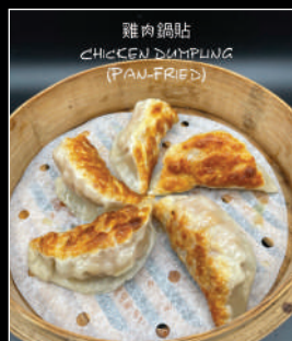
雞肉鍋貼 CHICKEN DUMPLING (PAN-FRIED)