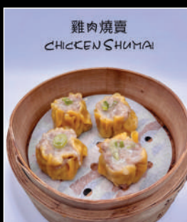
雞肉燒賣 CHICKEN SHUMAI