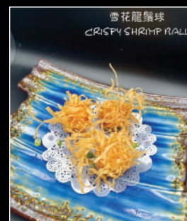
雪花龍鬚球 CRISPY SHRIMP BALL