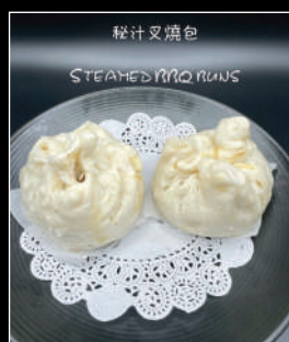
秘汁叉燒包 STEAMED PORK BUNS