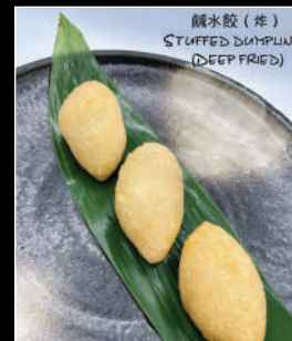
鹹水餃 (炸) STUFFED DUMPLING (DEEP FRIED)