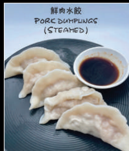
鮮肉水餃 PORC DUMPLINGS (STEAMED)