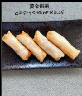
黃金蝦捲 CRISPY SHRIMP ROLLS